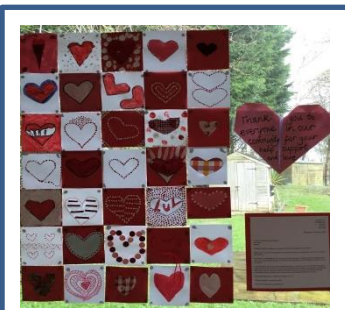
Year 6 wrote letters to people in our community thanking them for their help and support during lockdown. They received some wonderful replies.