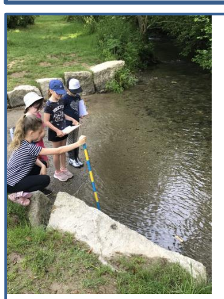
Year 3 exploring Cardinham Woods last week

Investigating and exploring pig's hearts really made pupils aware of the importance of having a healthy lifestyle and diet. So much fun and so much learning:) well done Year 6