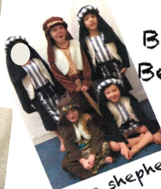
Busy, Busy Bethlehem