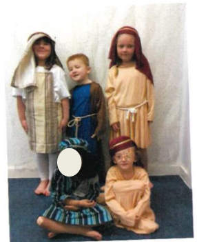
The village people