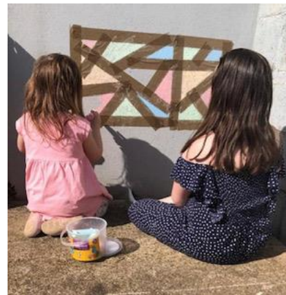
Imogen and Paige creating a masterpiece on their house