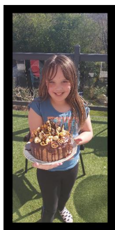
Some of our Year 5's showing off their awesome cooking skills