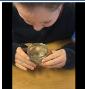
Year 6 Artwork

In science Year 4 investigated how we could show that sound is made of vibrations. We put some salt onto tight clingfilm, hummed near it, and the salt vibrated around