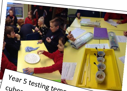
Year 5 testing temperatures of ice cubes and hot chocolate!