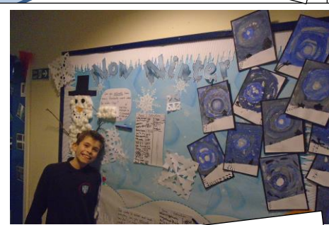
Olaf the snowman that Year 4 made then had to estimate how many cotton wool balls it took!