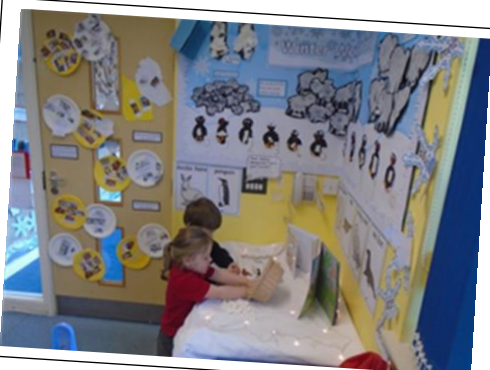
Nursery painted on ice and made igloos out of sugar cubes!