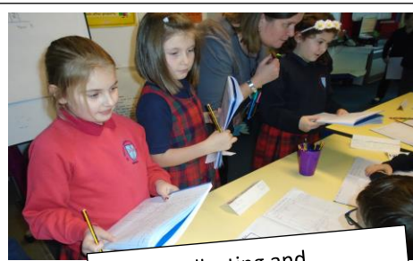
Year 3 collecting and recording data about winter