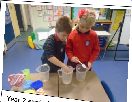
Year 2 exploring the waterproof properties of different materials to make an umbrella