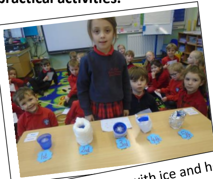
Year 1 experimenting with ice and how long it takes to thaw with insulation!

Pupils across the school having fun while learning about a variety of winter themes through experiments and practical activities.